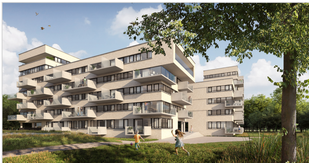
Elysia Park, Edegem