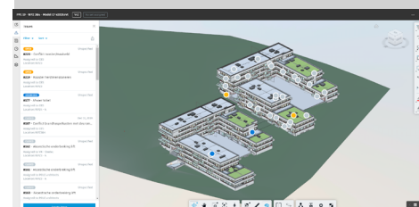
Online architectural 3D model with comments